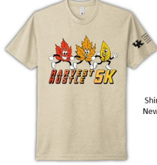
Shirt pictured is last year's design. New logo is being created for 2023 Harvest Hustle 5K.

Pre-registered racers will receive a race t-shirt. Race day registrants will receive a t-shirt while supplies last. *For questions, call 859-234-5510